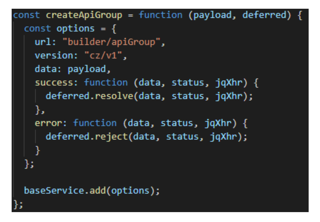
Figure 2 : Sample calling Custom REST Services