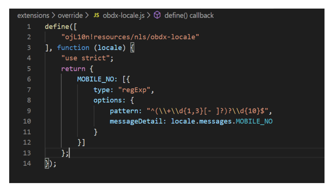
Figure 1 : Sample obdx-locale.js override

For Example: If you need to change the pattern which validate Mobile Number. Add updated pattern in this file as below.